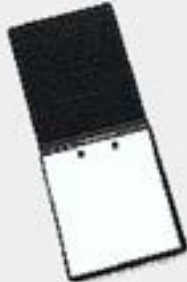
2-Hole 1" Inch Binder 225-240 Pages Each