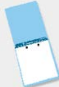
2-Hole 2" Inch Binder 450-480 Pages Each