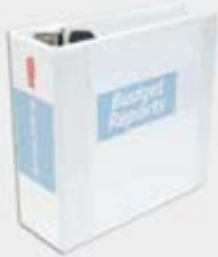
4" Inch Binder 750-780 Pages Each