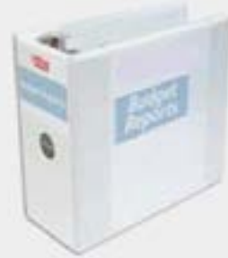
5" Inch Binder 950-1050 Pages Each