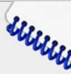
Plastic Coil/Spiral Binder 175-200 Maximum Pages Each